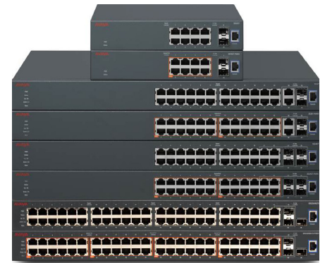
Figure 1: The ERS 3500 product family

It also supports IEEE 802.3at Power over Ethernet Plus (PoE+) which can power IP phones, wireless access points, surveillance cameras and other devices. PoE+ with its 32-watt power budget ensures investment protection for current as well as future high-powered end points.