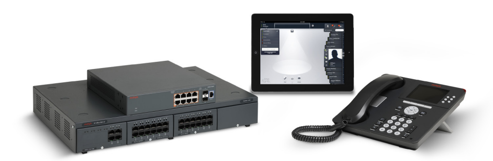
Figure 2: ERS 3500 with IP Office, the Avaya Flare® Communicator for iPad Device and an Avaya 9600 handset

Typically in smaller environments there is little to no local IT staff. Therefore, equipment purchased to