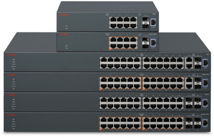
Figure 1: The ERS 3500 product family

The Avaya Ethernet Routing Switch (ERS) 3500 is a series of high-performance compact Ethernet switches specifically designed for SME's, branches and open environments outside of the wiring closet.